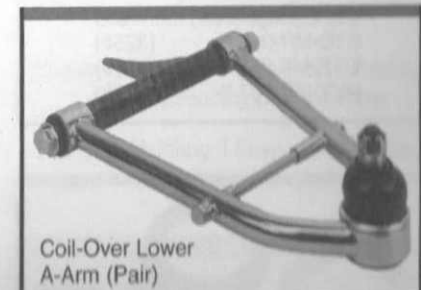
Coil-Over Lower A-Arm (Pair)

NA Nar ava for per Upp Abo Low Abo Low Abo CA Now desi acce Aval for Low Abo Low Abo