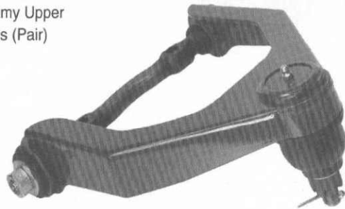
Economy Upper A-Arms (Pair)

Finally, Mustang II Full A-Arms for the budget builder. Heidt's Hot Rod Shop has designed cost conscious control arms for the builder who does not require the high tech look of tubular control arms but wants the ease of installing custom full A-Arms on his Mustang II I.F.S. The upper arms are a direct replacement for factory arms. The lower A-Arms have the same wide triangulated spread that Heidt's full tubular lower A-Arms do, so they need no strut rods.