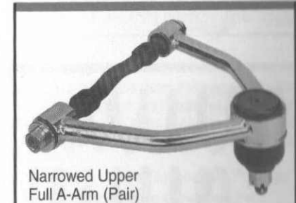
Narrowed Upper Full A-Arm (Pair)