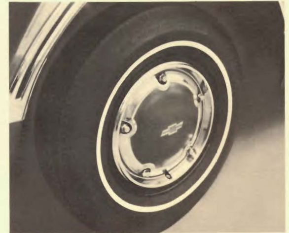
NEW WHEEL TRIM COVERS